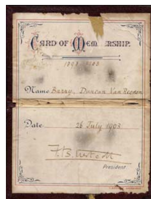
Old Shirburnian Society Membership Card